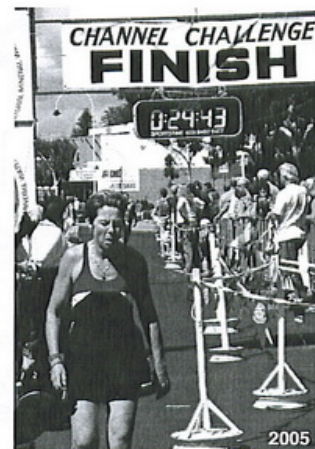
Changing my perception lead to my recovery.

“I found I was not alone and was invited to take part on the National advisory panel for Chronic Pain Australia (CPA) - a not for profit consumer organisation advocating and leading the consumer arm of the National Pain Summit - later to become the (NPS) and a world leading model used in the Declaration of Montreal to see pain management be observed as a Human right”.