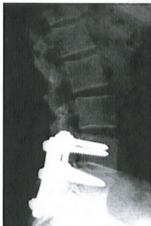
The type of pain life can dish up ..... and the repair of a severely damaged spine.

“Through an amazing spiritual (para-normal to some) experience I found the will and strength to re-learn and discovered when the student is willing the teacher appears”.